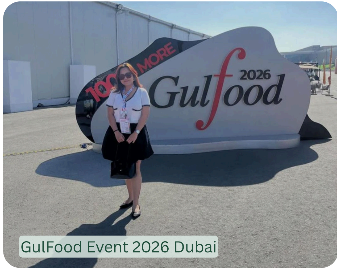
GulFood Event 2026 Dubai