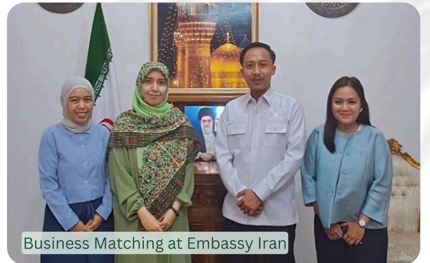
Business Matching at Embassy Iran