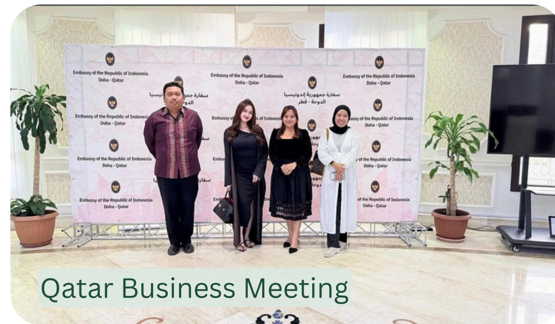
Qatar Business Meeting