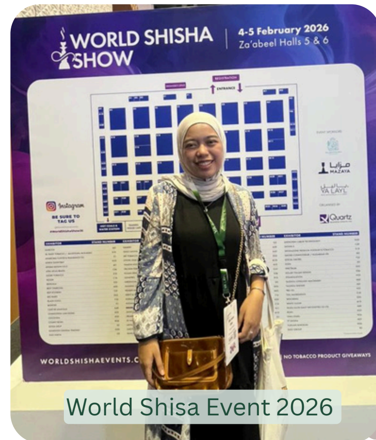
World Shisa Event 2026