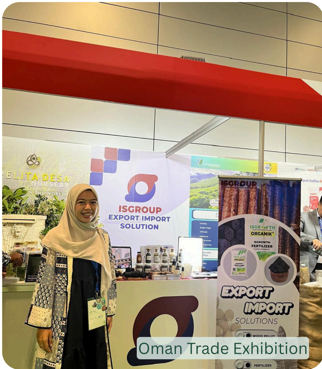
Oman Trade Exhibition