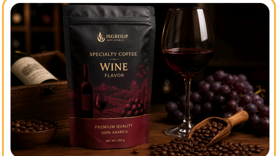
OEM & PRIVATE LABEL