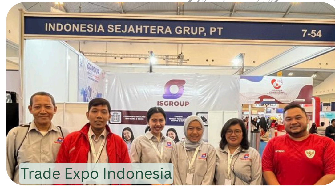
Trade Expo Indonesia