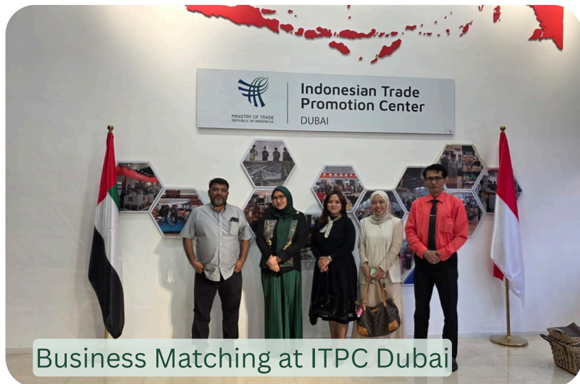
Business Matching at ITPC Dubai