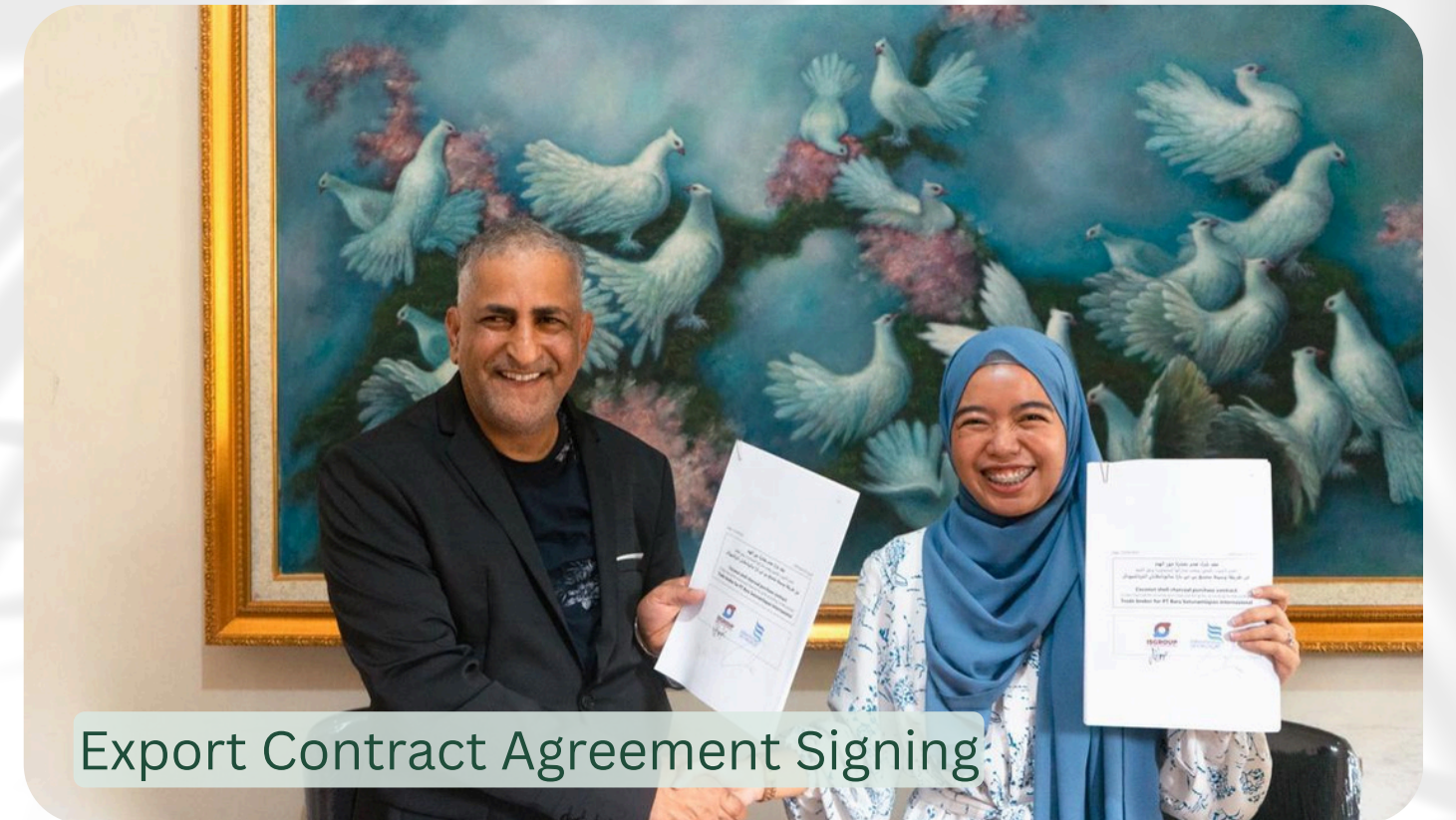
Export Contract Agreement Signing