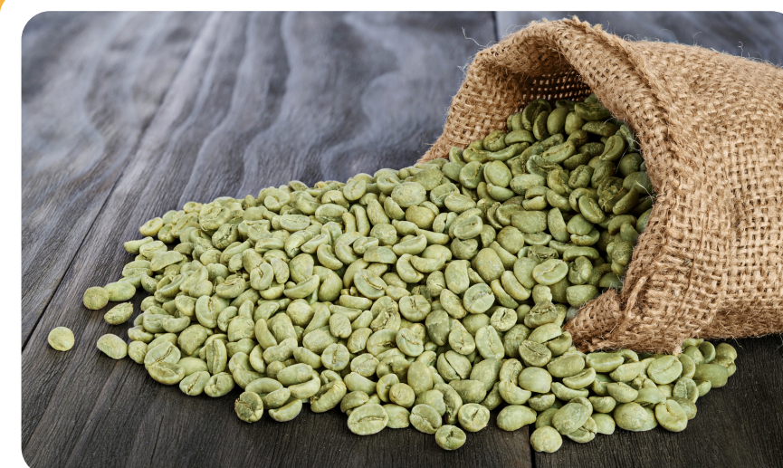
GREEN BEANS COFFEE